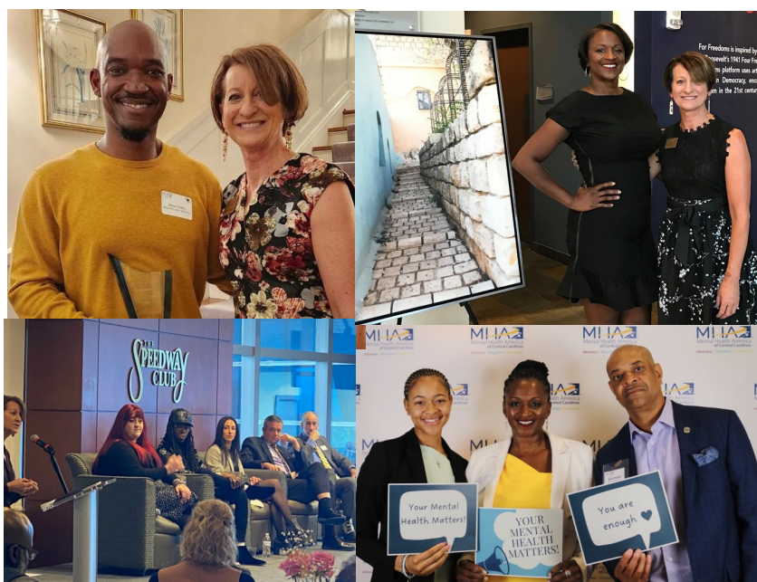
Past Annual Events L to R, top to bottom: MHA's Chocolate Therapy Recognition Event, Art In Mind, Legislative Breakfast and Wake Up for Wellness Breakfast